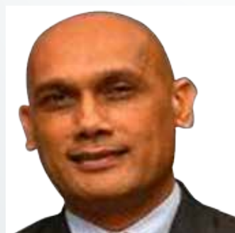
Dr. Kailesh Kumar Singh Jagutpal Hon'ble Minister of Health and Wellness, The Republic of Mauritius