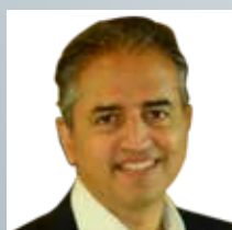
Dr. Devi Prasad Shetty Chairman, Narayana Health